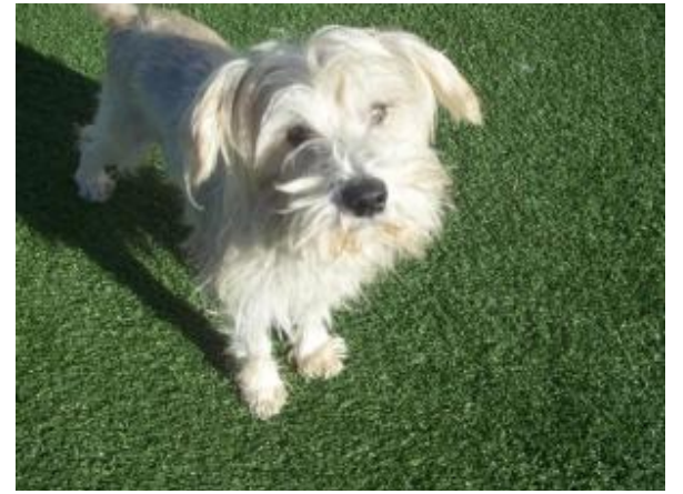
Toby – a 15 lb. terrier mix who is housetrained and great with kids; very well behaved