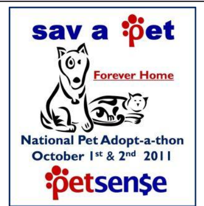
Participated in the Pet Sense Adoption event for 3 rd year!