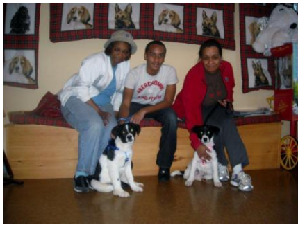
Diamond and DJ – Adopted Together!

Adoptions picked up in December , and we are excited to report that eight dogs went to their new home! Brody was adopted before we could even post him on Petfinder, and Diamond and DJ were adopted together!