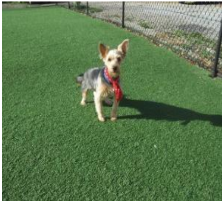
Prince – a happy and fun six-month-old Yorkie