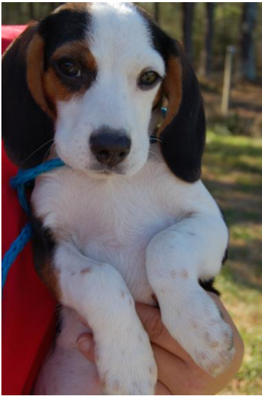
Trinity – a four-month-old Beagle puppy