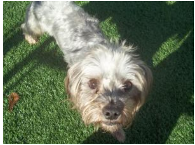
Sprinkles – a Yorkie mix who is about three years old. He is sweet and needs a home with older children or adults only.