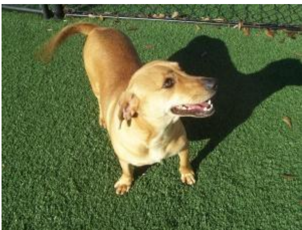
Susie Q is a young Dachshund mix who is housetrained and great with other dogs and all people!