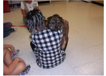
Received over $1000 raised by Locust Grove Middle School / Beta Club (Loeey pictured with student)