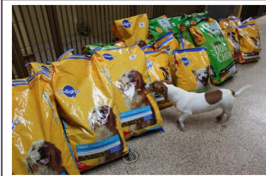
Received a generous food donation from AIT Logistics (Toby, pictured above, inspects donations from the team)