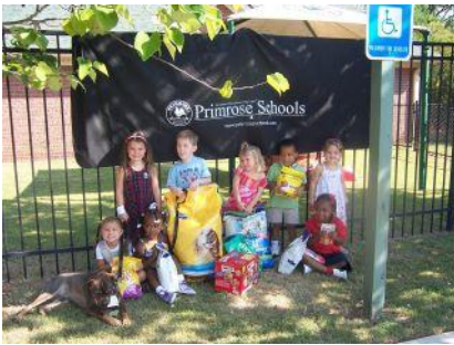
Received food donation from Primrose Academy in Stockbridge